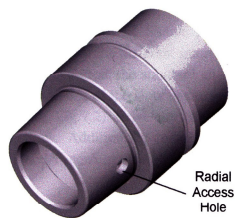
Fig. 4.11. Optional feature of an HSK Shank, Type E